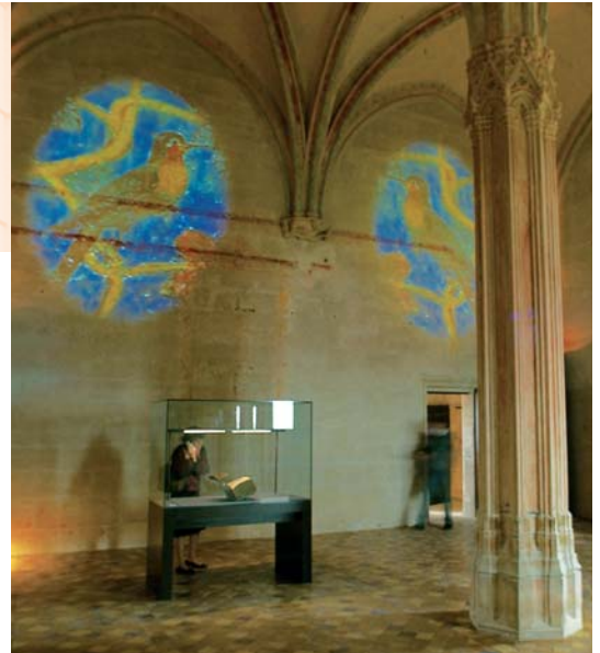
Château of Vincennes - New tour