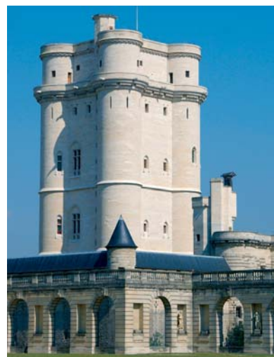
Château of Vincennes