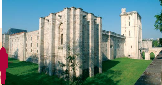
Château of Vincennes